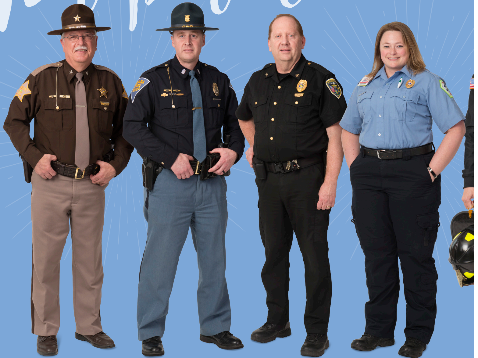
Pictured - Wabash County First Responders